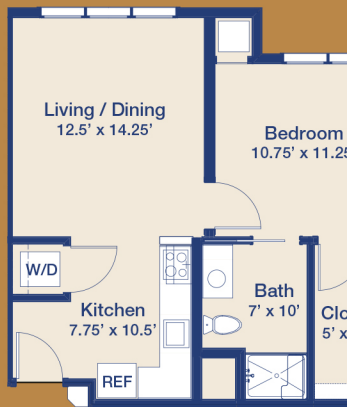
One Bedroom 592-794 Sq Ft