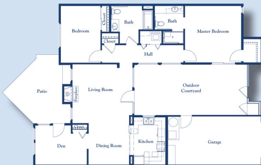
Cottage Floor Plan 1300 Sq Ft

Floor plan square footage and layout may vary